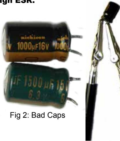
Fig 2: Bad Caps

We know the capacitors in figure 2 are bad because we can see they are puffed out the top . Let's confirm the 1000uf 16v is bad. ESR test results from the Capacitor Wizard® (Fig 4) show 2 ohms. We would expect a good 1000uf 16v capacitor to test below 0.5 Ohms. This part is BAD due to high ESR.