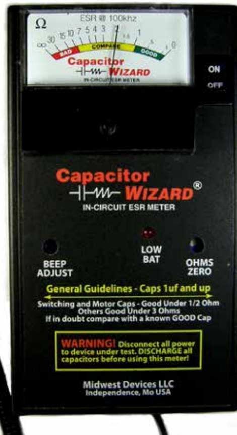
Fig 4: Capacitor Wizard® Cap1B