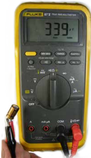
Fig 3: Fluke 87-V Multimeter

Capacitance should be near 1000uf. It is only 339uf. The part is also BAD due to low capacitance. But even if the capacitance was near 1000uf the part is still bad due to high ESR . If a part fails the ESR test you don't need to check capacitance. REPLACE IT!