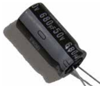
Fig 5: A low ESR capacitor. 680uf 50v ESR > 0.050 Ohm. Nichicon PW series Part # UPW1H681MHD