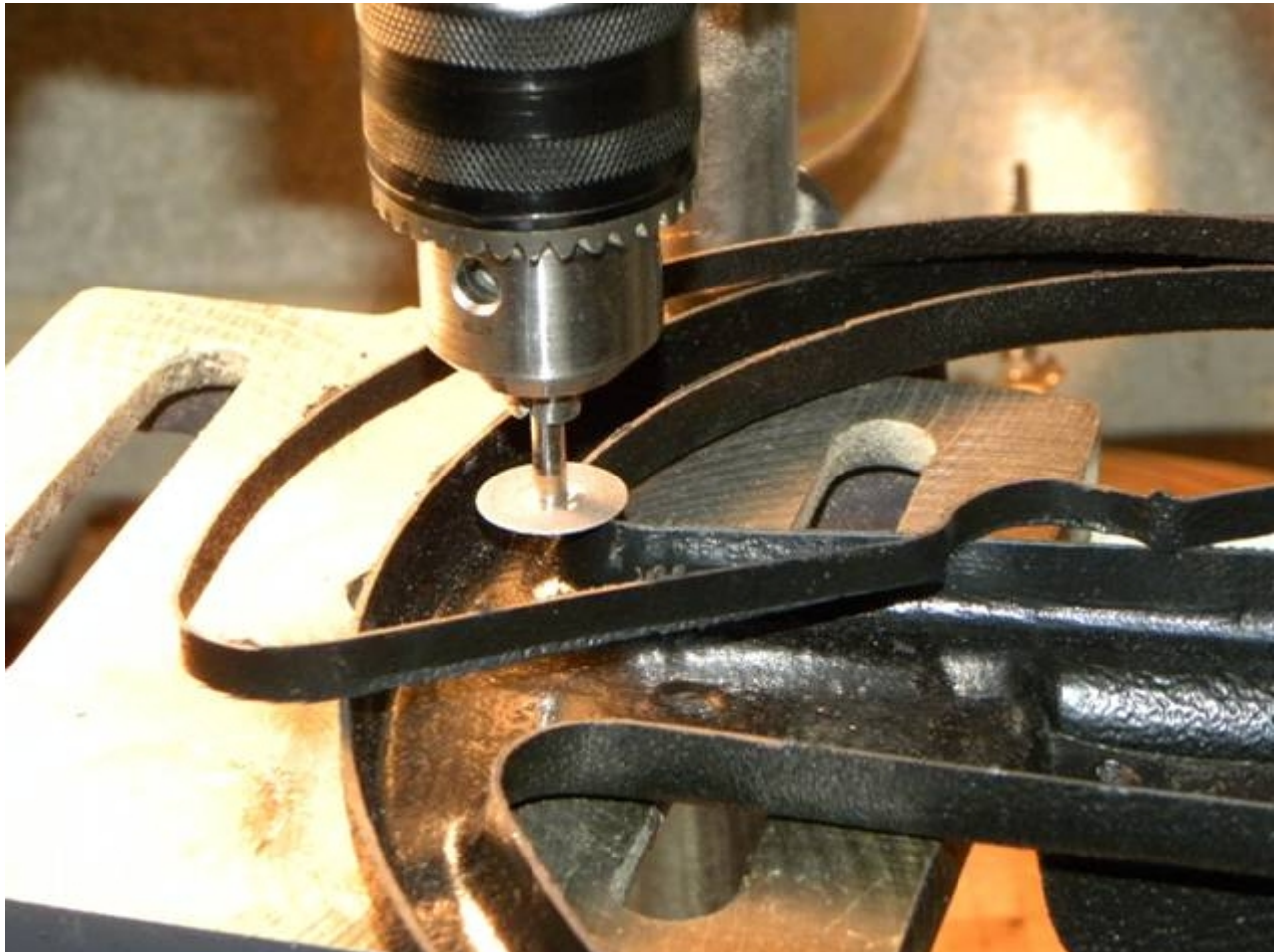
Cutting the shell.