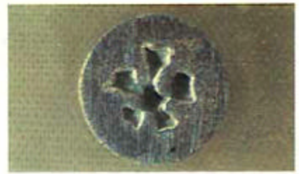
Competitors' imitation 5-Core Solder

Flux-cored solder wire is universally made by an extrusion process followed by drawing through dies progressively reducing the wire diameter from say 16 mm to the required diameter which is normally in the range 3 mm to 0.2 mm. As solder is opaque and usually contains lead it is not possible to see and test inside the wire to check for flux presence. The extrusion process is subject to variations of pressure and temperature which can lead to occasional blockages or contractions of the flux core. The shortest of such a flux void at the extrusion stage results in a much longer length without flux in the drawn down wire. Any gap in the flux continuity will result in a "dry" faulty joint. Solder cannot join metals without flux.