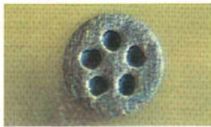
Ersin Multicore 5-Core Solder