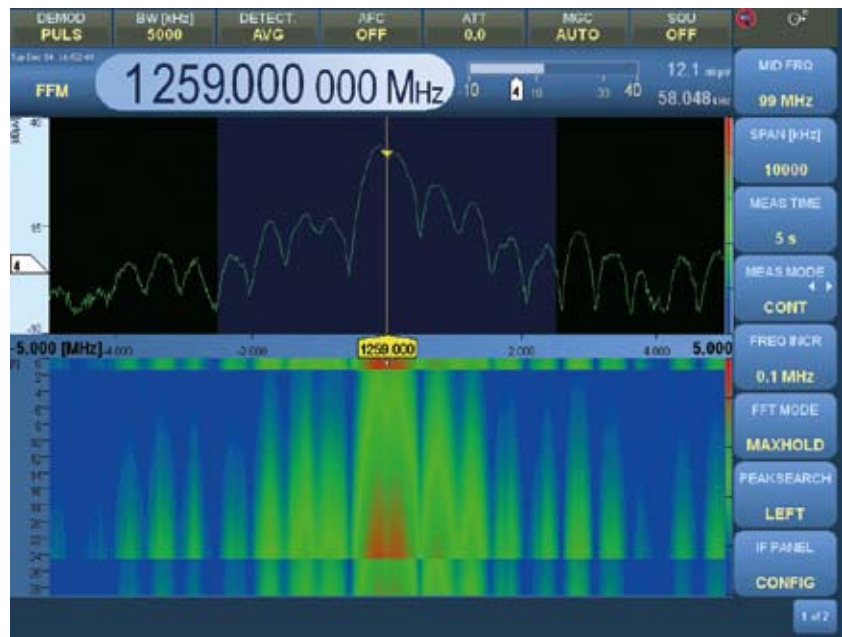
Detection and analysis of a radar pulse

To enable more in-depth analysis of the signal spectrum and signal environment, the receiver is equipped with an IF panorama. The current receive frequency is at the center of the spectrum display. The span can be set between 1 kHz and 20 MHz for optimal adaptation to the task at hand. MINHOLD, MAXHOLD and AVERAGE displays are also possible, allowing an even broader scope of applications.