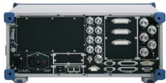
Rear view of the R&S® ESMD

Due to its compact design and many special functions, the R&S® ESMD is ideally suited for detecting all types of radio interference. Special functions such as an adjustable measurement time and continuous or periodic level output have been integrated for these tasks. Since these functions also work in the HF spectrum, it is easy to find even non-periodic interferers which would otherwise be difficult to detect due to their irregular appearance in a quickly changing spectrum. As a result, the source of interference can be quickly detected and eliminated – an aspect that is extremely important in security-critical radio traffic (e.g. airborne communications, air traffic control, ATC).